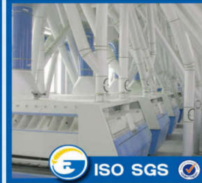
200 tons in Dubai