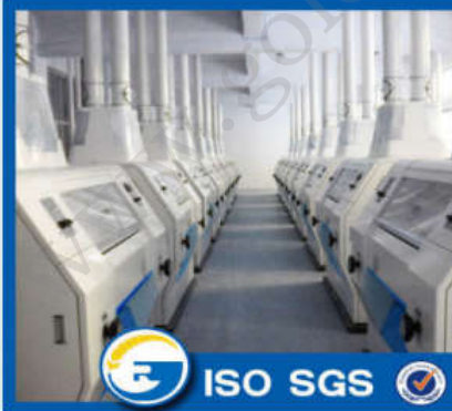
200 ton in America