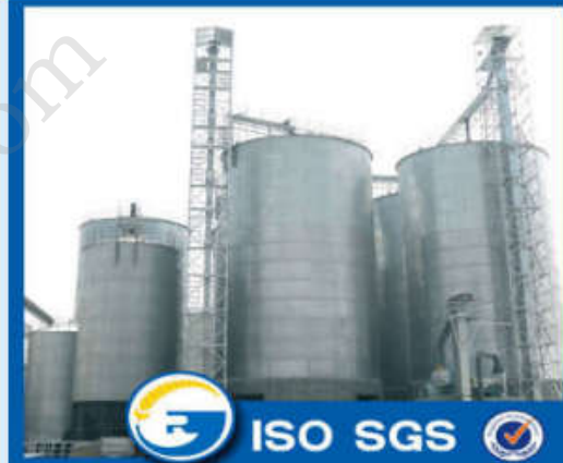
4*500 ton silo in Brazil