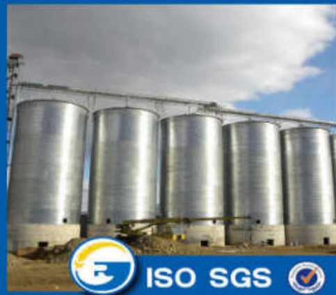
6*1000 ton in Albania