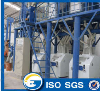
50 Tons in Tanzania