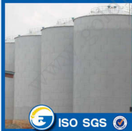
6*2000 MT Silo Mongolia