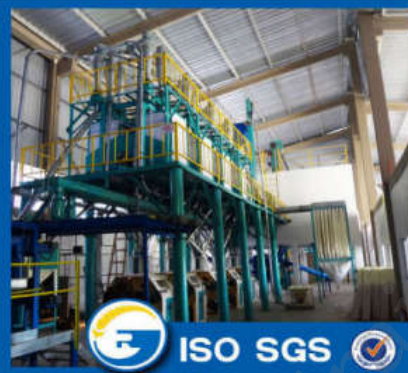
50 Tons in Brazil