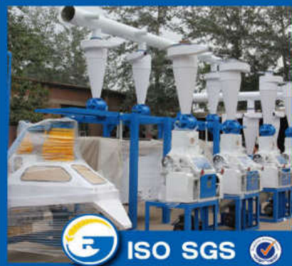
30 Ton in Congo