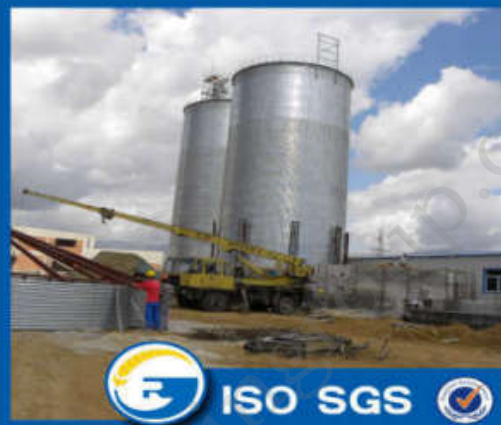
2*1000 ton in Australia