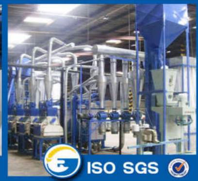
30 Tons in Zambia