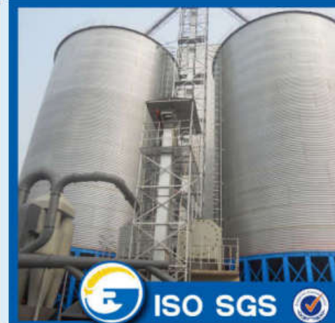
2*1000 ton Melbourne