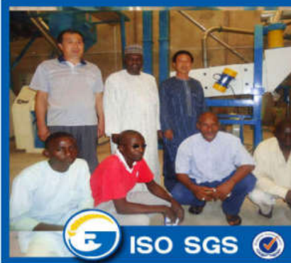
50 Tons in Nigeria