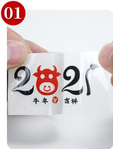
Tear off the transfer sticker