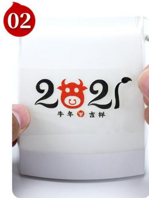
Align and paste